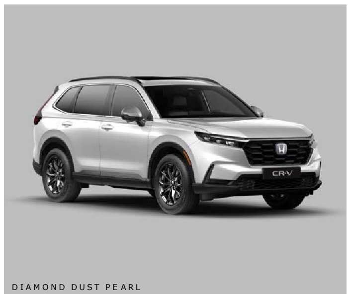
DIAMOND DUST PEARL