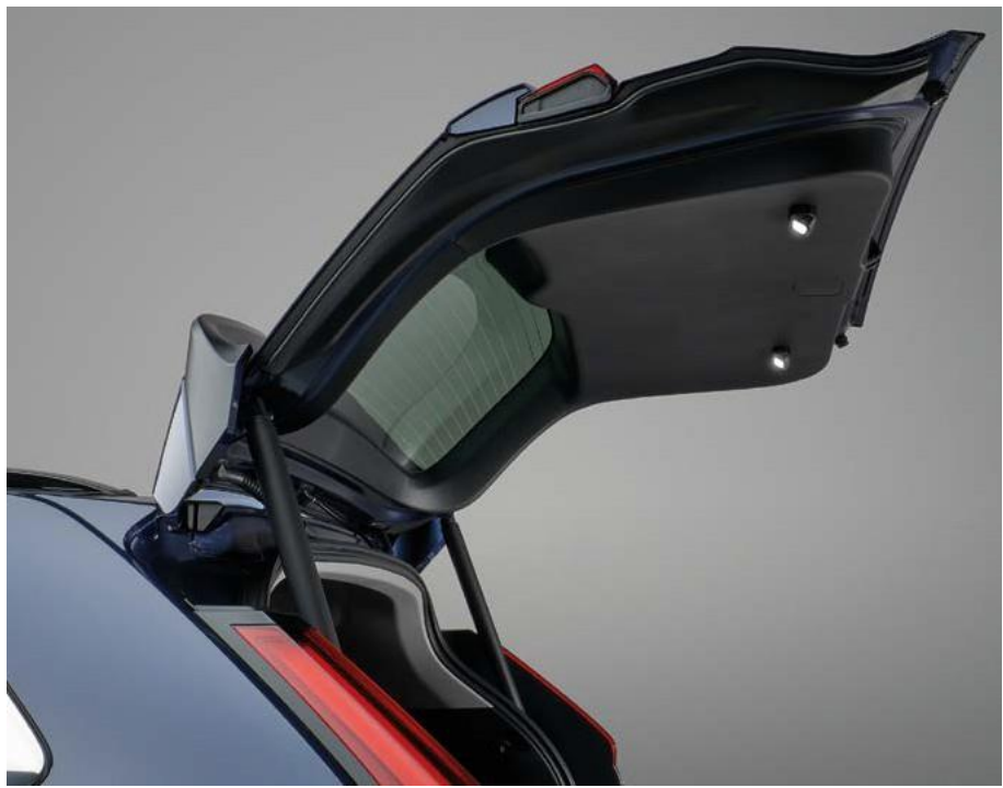
TAILGATE ILLUMINATION The tailgate illumination has been developed to increase your comfort and safety by illuminating not only the boot, but also the area behind your car. The LED lights installed on the inside of the tailgate provide a powerful and consistent light in the boot, even when fully loaded.