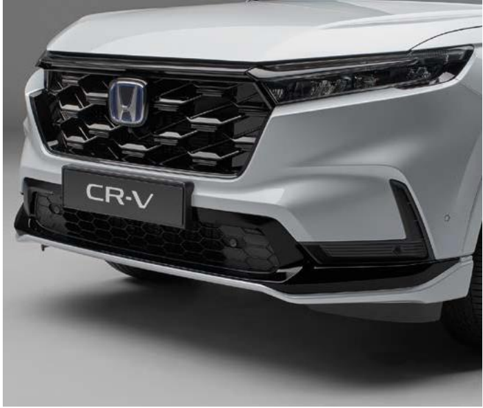
FRONT AERO BUMPER Enhance the dynamic look of your car with the front aero bumper. Featuring a body colour and Berlina Black colour combination to give the bumper area a premium feel.