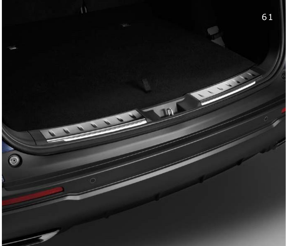
ILLUMINATED BOOT SILL DECORATIONS Protect the boot sill by fitting this stainless steel boot sill trim. It features illumination when opening the boot lid to help with visibility at night.