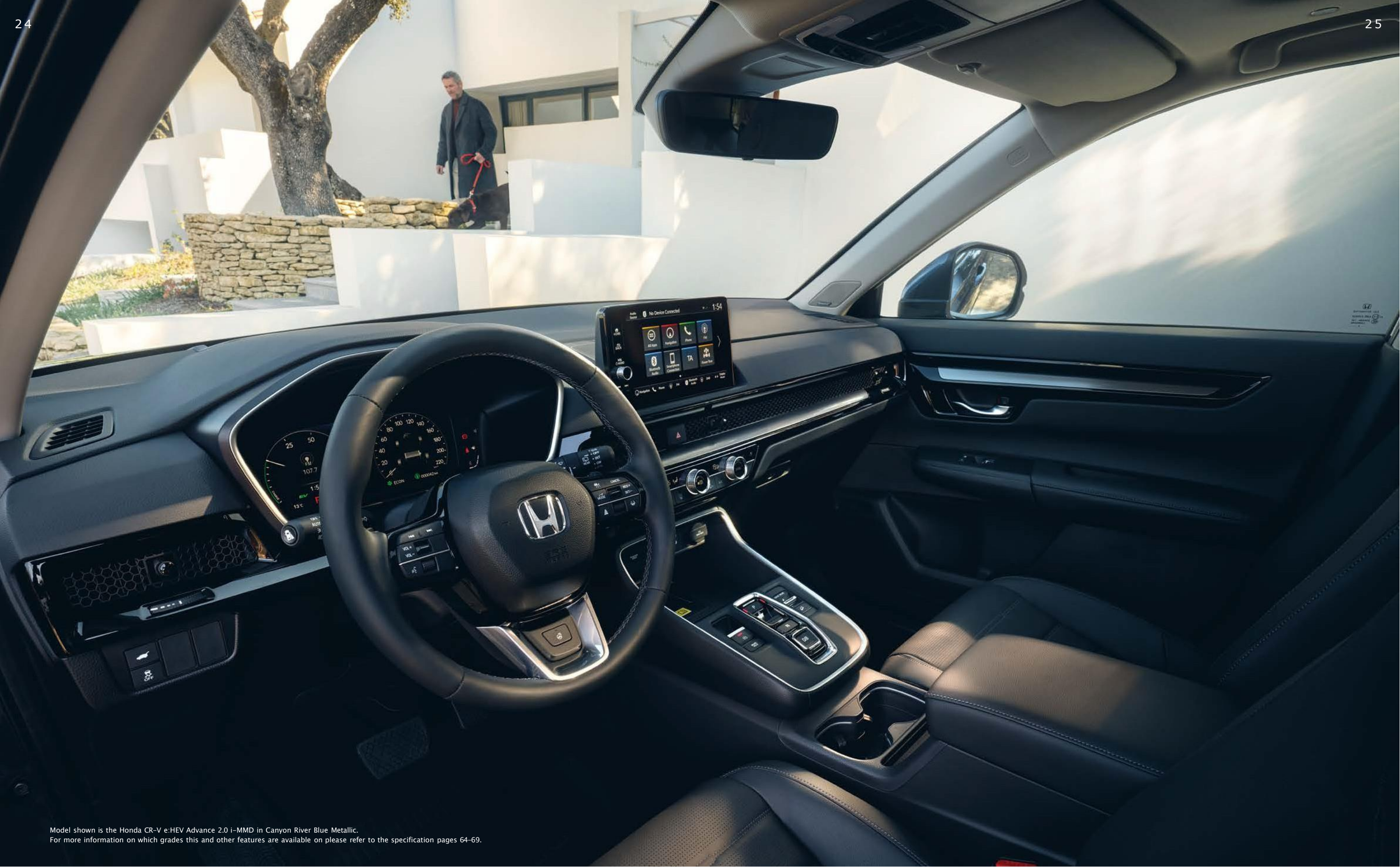
Model shown is the Honda CR-V e:HEV Advance 2.0 i-MMD in Canyon River Blue Metallic. For more information on which grades this and other features are available on please refer to the specification pages 64-69.