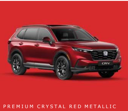
PREMIUM CRYSTAL RED METALLIC