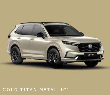
GOLD TITAN METALLIC*