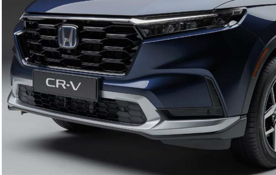
FRONT AERO BUMPER Enhance the dynamic and premium style of your CR-V with this distinctive front aero bumper.

The pack includes: a front aero bumper, a rear lower bumper, door mirror covers and side skirts, all finished in Lunar Silver complemented by a body-coloured tailgate spoiler.