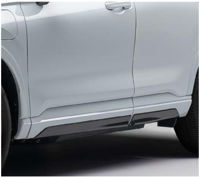
SIDE SKIRTS Give your car an exciting and sporty profile by adding these side skirts.