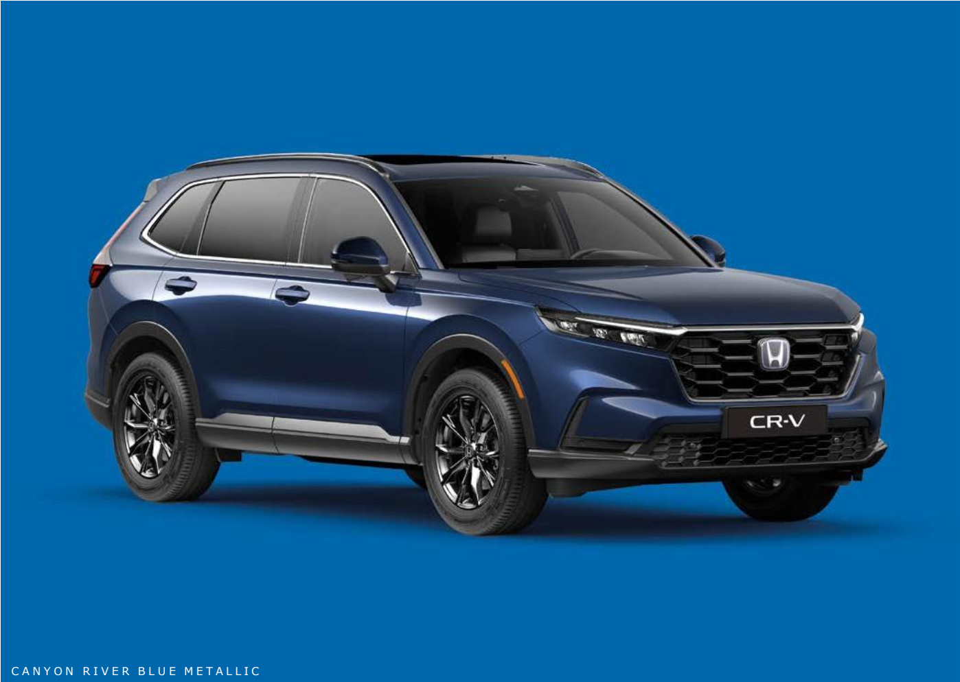
CANYON RIVER BLUE METALLIC

Choose from a range of contemporary colours that reflect your personality and the dynamic design of the new CR-V.