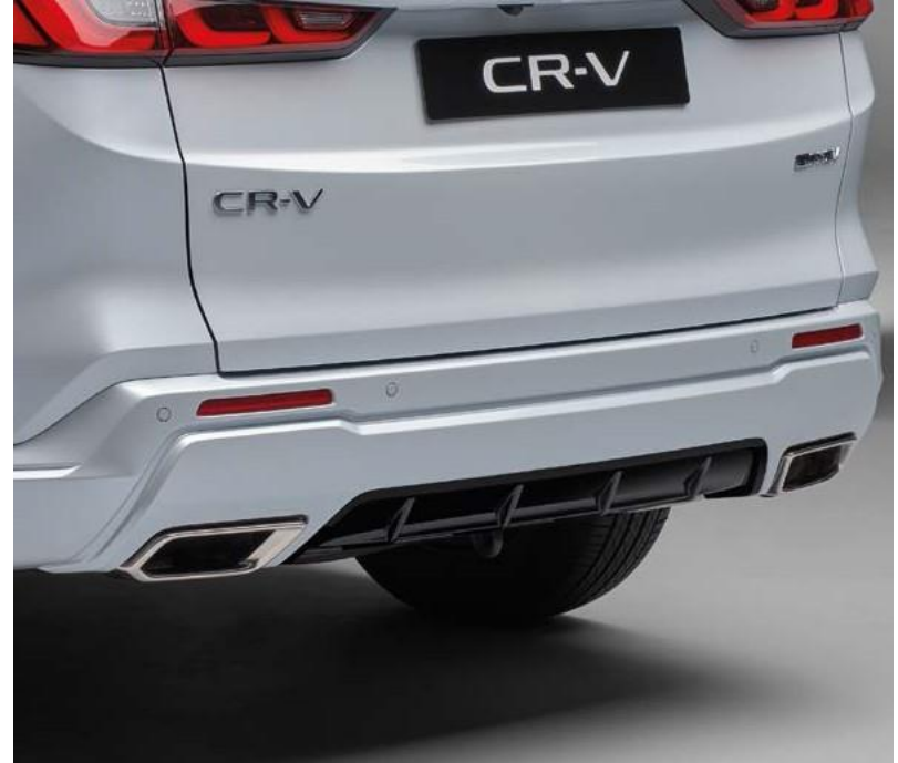
REAR LOWER BUMPER Complete the look of your CR-V with this rear lower bumper in a body colour and Berlina Black colour combination. It blends in perfectly with the front aero bumper and side skirts.