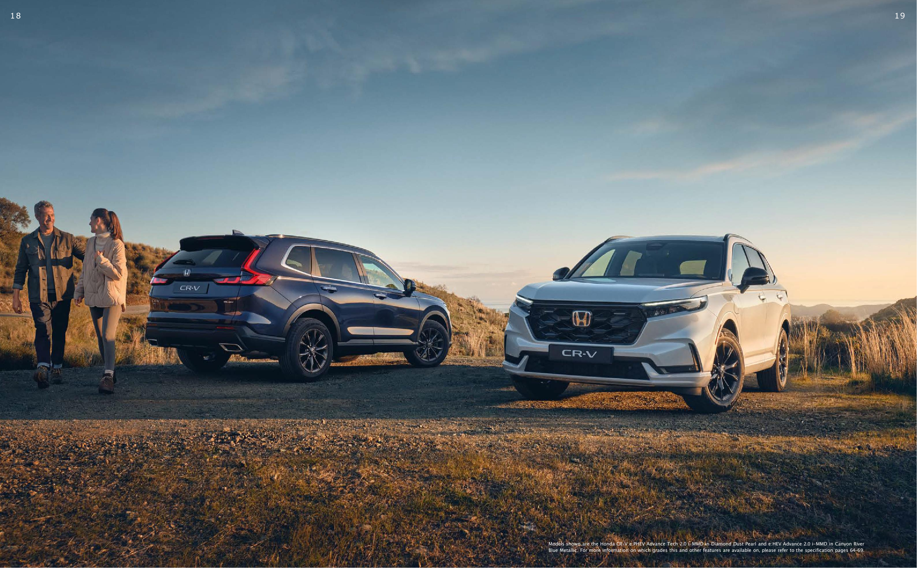
Models shown are the Honda CR-V e:PHEV Advance Tech 2.0 i-MMD in Diamond Dust Pearl and e:HEV Advance 2.0 i-MMD in Canyon River Blue Metallic. For more information on which grades this and other features are available on, please refer to the specification pages 64-69.