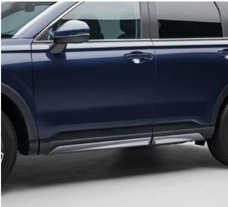
SIDE SKIRTS Give your car an exciting and sporty profile with these stylish and sleek side skirts.