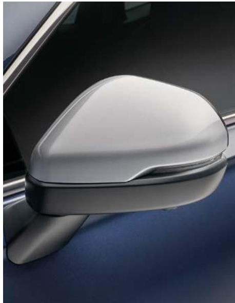
DOOR MIRROR COVERS Add a little individuality with these smart door mirror covers, designed to fit your CR-V seamlessly.