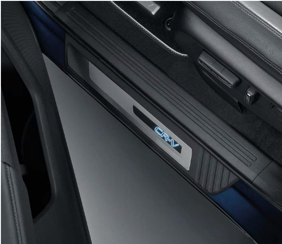
ILLUMINATED DOOR SILL TRIMS Add an extra touch of style to your CR-V's interior with the illuminated door sill trims. The stainless steel finish glows with a CR-V logo for sleek lighting when you open the door.