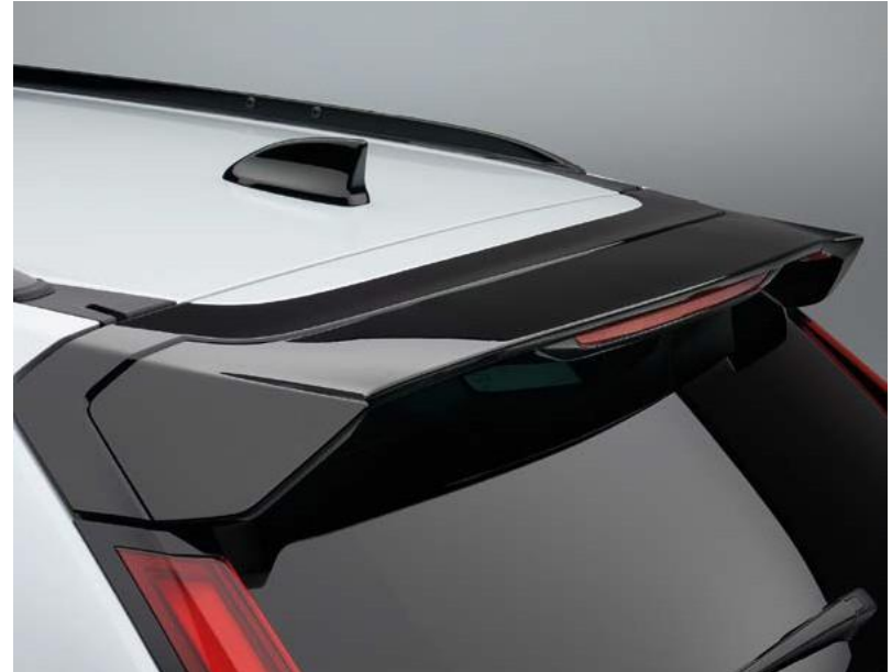
TAILGATE SPOILER Add some extra sportiness to your CR-V with the tailgate spoiler, which complements the lines of the roof and rear of the car.