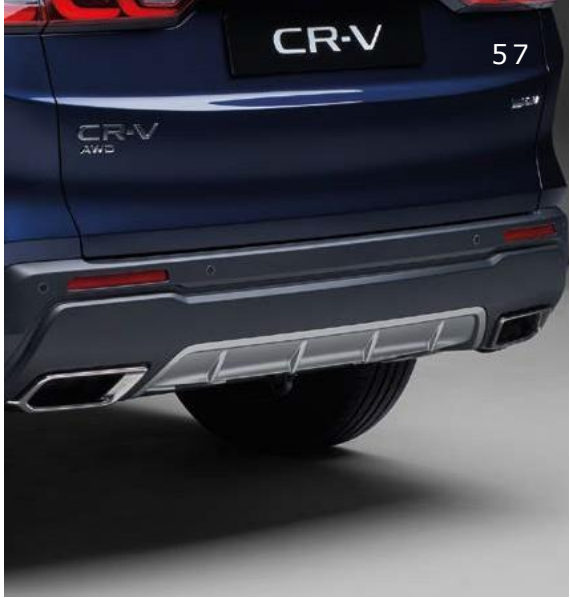
REAR LOWER BUMPER This rear lower bumper perfectly complements the front aero bumper and side skirts, completing the sporting look.