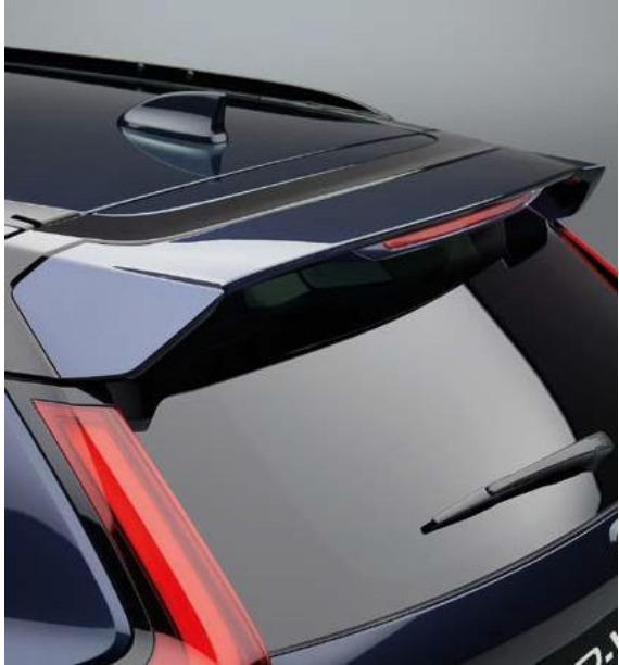
TAILGATE SPOILER The body-coloured tailgate spoiler complements the lines of the roof and accentuates the sporty styling.